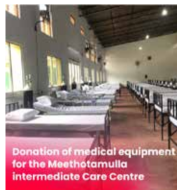
The Meethotamulla Intermediate Care Centre

Critical care infrastructure enhancement is important in the fight against Covid-19 and this project was facilitated by Rotary District 3220 – Sri Lanka and