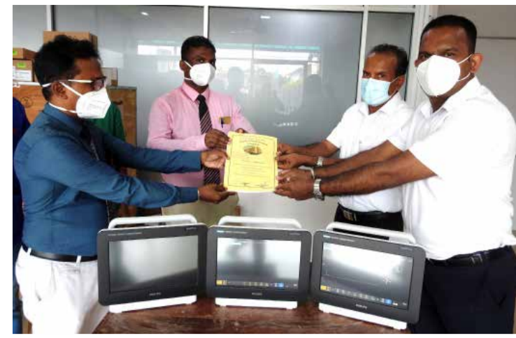
Management members of DSI Tyres handing over the equipment to Gampaha District General Hospital officials